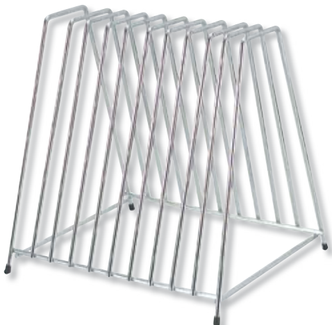
Rack for Boards 10 Slot